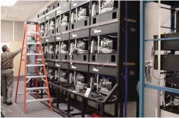
At the heart of the Mesa display wall is a display wall processor that enables the large display to draw inputs from many different sources and formats to size and show them anywhere on the large screen.

To do this, Mesa had several objectives: