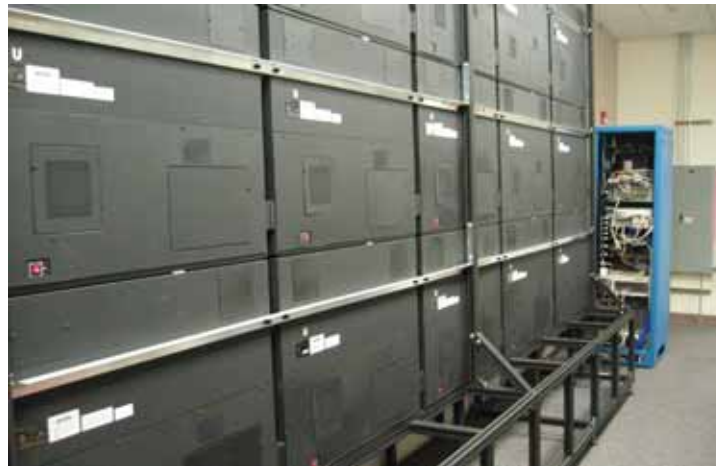
Rear view of the videowall, including the custom base and ceiling supports fabricated by AVR to ensure safety and proper alignment.

Moreover, all this video real estate can be subdivided in almost limitless ways. Individual cubes can be dedicated to specific displays, or combined with others to make larger displays. Each cube can also display multiple windows of video or data. All in all, the videowall can meet virtually any display necessity that might arise.