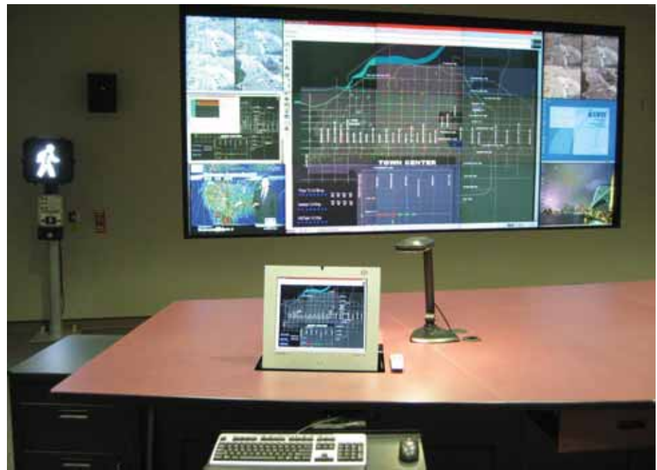
Engineer's workstation with view of the large 5x3 cube display wall, which allows all operators and managers in the TMC to view the same images at the same time.

able to a traffic management center from a remote video camera, the internet, a high-speed network, TV, workstation, PCs or their own applications. The results are faster, better decisions, coordinated efforts—and a reduction in cost.